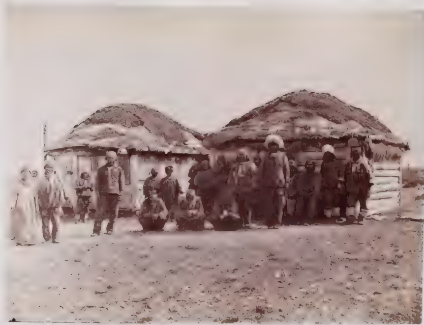
16. Male Esquimaux and Store Houses, Togiak.